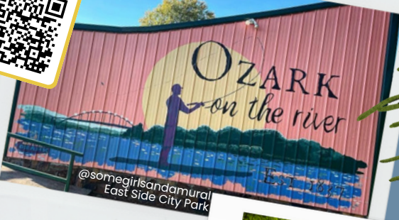
@somegirlsandamura | East Side City Park