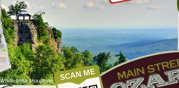
White Rock Mountain